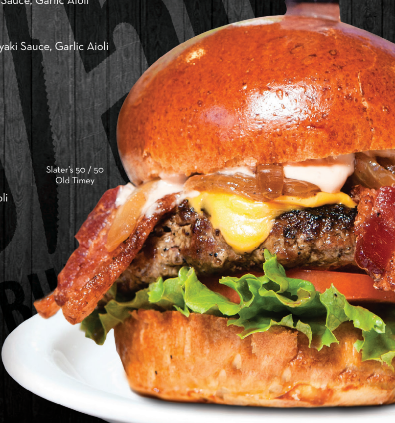
Slater's 50 / 50 Old Timey